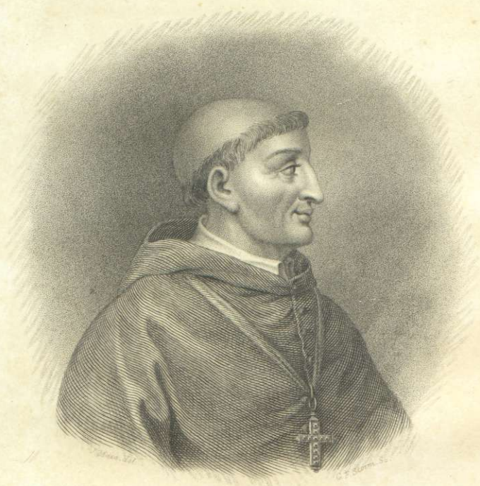
Cardinal Jimenez de Cisneros Regent of Castile.