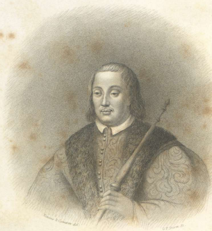
Ferdinand the Catholic.