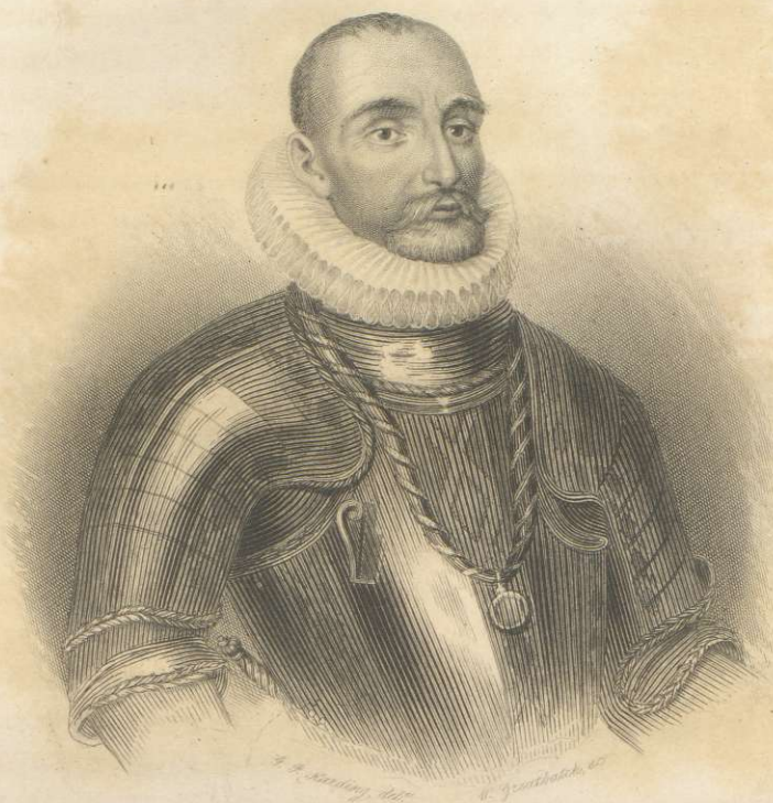
DON GONZALO FERNANDEZ DE CORDOVA.