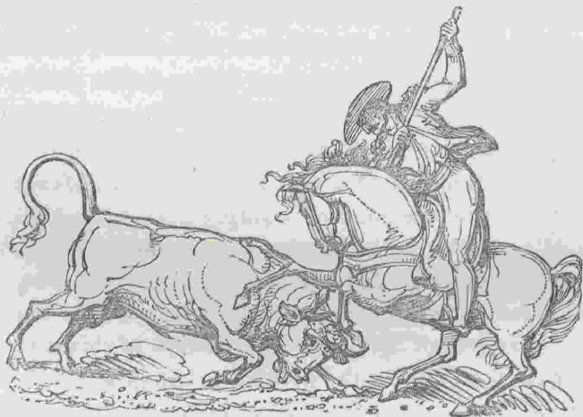
Bull-fight on horseback.

men dressed in the Moorish garb, who led the horses of their masters. These having mounted and received their lances, went beneath the royal balcony to salute the king, and each took care, doubtless, to catch the approving or cautionary glance of his mistress. The arena being cleared by the alguazils, the king waved his handkerchief; warlike music repeated the signal, and a bull was let in. The cavaliers approached him one by one with lances in rest, and their ardor was shared by their proud-spirited horses. Sometimes the bull would receive the spear deep into his neck, at others he would shiver it to pieces, and overturn everything in his course.