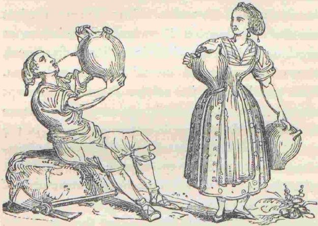
Costume of Catalonia.

the Scipios, Pompey, Julius Cæsar, and Augustus, as having trod the soil of Tarragona, to awaken the loftiest associations.