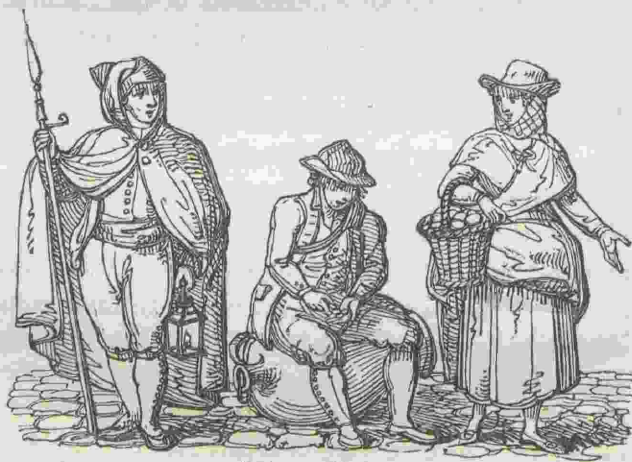
Costume of Madrid.

Of my own mode of life and occupations in Madrid it is unnecessary to speak, since they had little connexion with the customs of the country. It may, however, be proper to say something of the city and of the public spectacles and amusements, which have so much to do with forming, as well as elucidating, the manners and character of a nation.