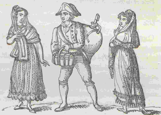
Costume of Madrid.