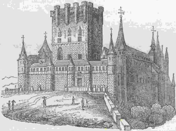
Tower of Segovia.

which we are indebted for the wonderful aqueduct. Thus the Alcazar is surrounded on these sides by perpendicular precipices. A deep trench, cut across the rocky platform, separates it from the city on the third, and renders it completely insular. The fortification consists of a huge square tower, surrounded by high walls, which stand upon the edges of the precipice, and are flanked with circular buttresses, having conical roofs in the Gothic style. The arches of the interior are circular, and very massive.