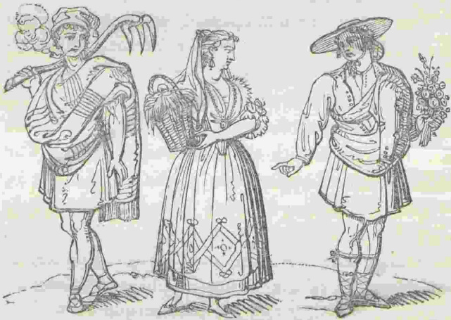
Costume of Valencia.

and their stout piers and massive arches gave sufficient indication of the occasional force of the Guadalaviar. The one over whose noisy pavement we were now rapidly drawn had been ornamented and sanctified by a rude shrine, dedicated to the patron saint of the city. At its southern extremity was a time-worn gate, covered with antique ornaments and inscriptions, through which we now entered into Valencia—Valencia the Fair—Valencia of the Cid.